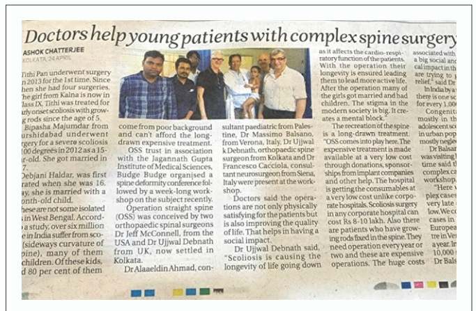
Statesman News _ 24th Apr 2022