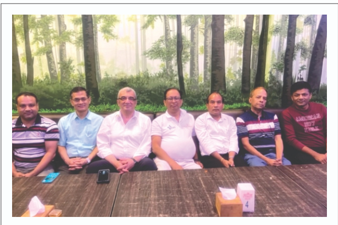
Surgeons at BPKIMS&H, Dharan, Nepal