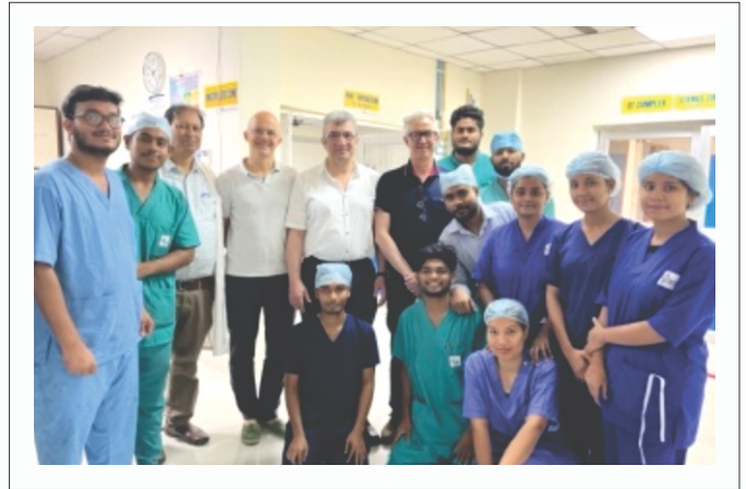
Operation Theatre Staff