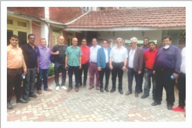
OSS'22 Team at Tolly Club